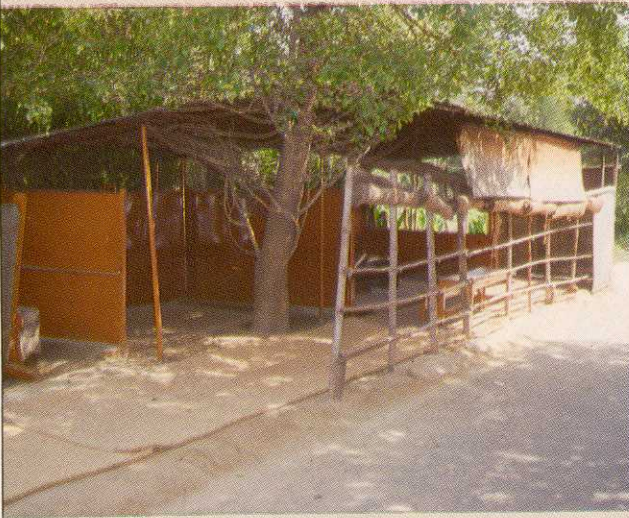
Sparrows while pecking