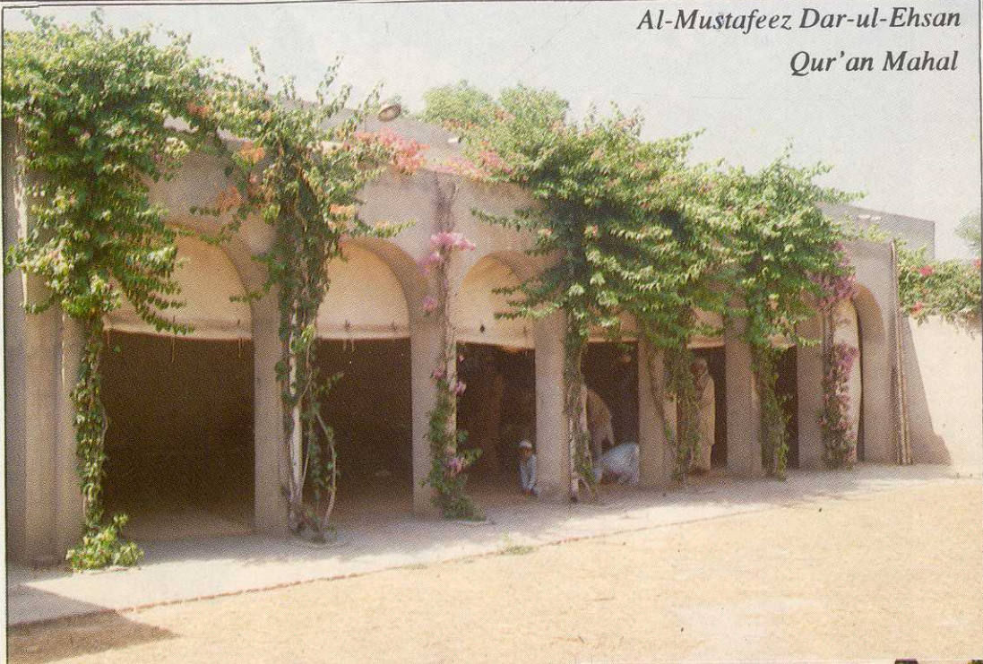
A hut-- "Realm of Faq'r"